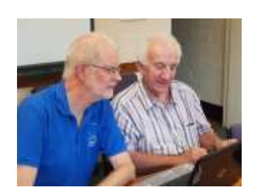
Continues on next page

The world we are in seems to depend on us having skills with technology to enable us to do the simplest of things... to listen to music, to write a book, to